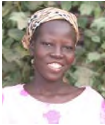
Meet the Children of Mission:Chad